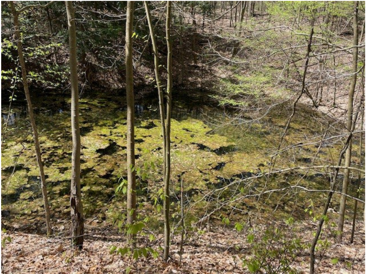
Figure 2-Example of a depressional area with no continuous surface connection to a jurisdictional water

SUBJECT: 2023 Rule, as amended, Approved Jurisdictional Determination in Light of Sackett v. EPA , 143 S. Ct. 1322 (2023), [NAB-2024-00161]